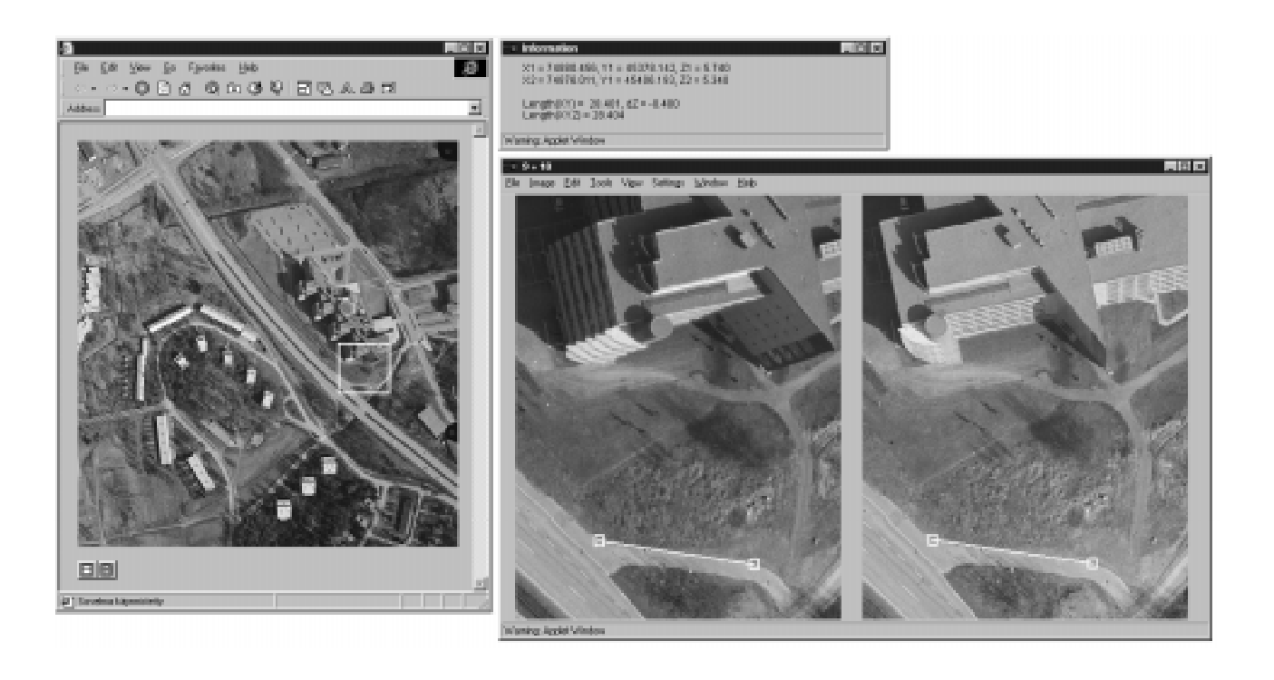
Figure 3 . A typical layout of the windows used in WebTop photogrammetry. The window on the left is a browser window displaying an overview image. The window on the left has been opened by a Java applet and contains a stereo imagery for the area in interest. A measured distance is displayed there also, the other measurement data being displayed in a separate window on the top.

An applet is a small Java program that can be embedded in another application, usually in a web browser. At this time both dominant web browsers - Netscape Navigator and Microsoft Internet Explorer - support Java applets. Because Java capabilities are built into web browsers or loaded as a plug-in, a Java applet itself requires no installation.