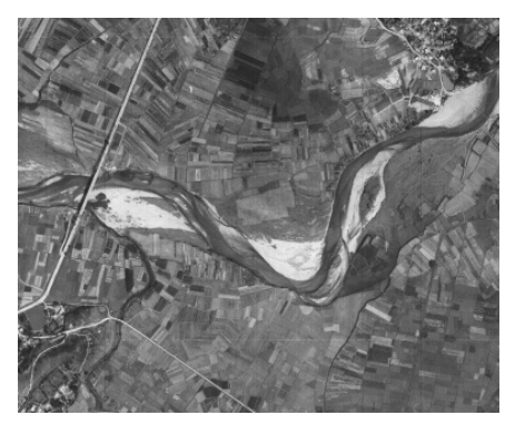
Figure 3. one of two image to be mosaicked

In order to verify the real effect of wavelet based algorithm, two images of the same ground areas with different lightness and contrast are used in our experiments. Figure 3 and Figure 4 are the original images to be mosaicked, the former is darker and with lower contrast, the latter is brighter and with higher contrast. Figure 5 is the result that hasn t been processed using wavelet based algorithm, in which the gray seamlines occur obviously. Figure 6 is the result that has been processed using wavelet based algorithm, in which there are no gray seamlines. This experiment indicates that wavelet based algorithm is very effective and can acquire satisfactory results in gray seamline removing.