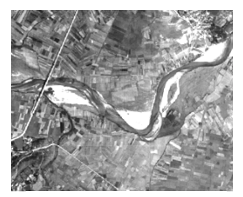
Figure 6. the mosaicked image after seamlines removed