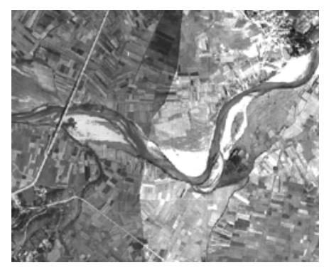
Figure 5. the mosaicked image without seamline removing