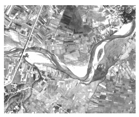
Figure 4. the other of two image to be mosaicked