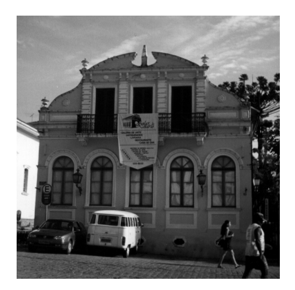
Figure 1. Solar of Rosário

Programs of maintenance of historical monuments were developed over all the world. In Brazil the subject began to be discussed in 1920, nevertheless there are few works that used the photogrammetry for data acquisition. With the