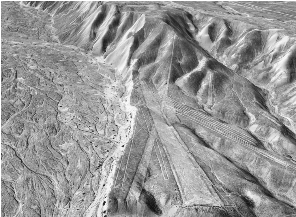
Figure 3: View of a geoglyph site on the Pampa de San Ignacio generated with ERDAS Imagine 8.4

Though based on black and white images, the 3D model gives a very realistic impression of the area of investigation due to its accuracy and the high-resolution orthomosaic used as texture (Figs. 2, 3). Moving through the model allows reconnoitering the valleys, the ridges and the plateaus of Palpa and seeing the terrain and the geoglyphs in great detail. Navigating in real-time mode or via pre-recorded videos, one can virtually ascend from the valleys to the plateaus, which gives a much better idea of the landscape and its characteristics and dimensions than the usually shown photos of the Nasca region taken from airplanes.