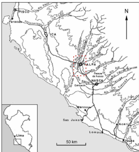
Palpa in the Nasca region on the south coast of Peru

--- Area of investigation (see Landsat image)