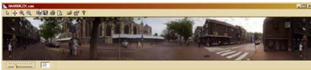
Figure 3: Cyclorama in panoramic perspective

In conjunction to the solution of Kolbe we have studied [Anrooij, 1997] the application of panoramic images as a solution for the map information process. A special approach in this solution is the use of the so-called Cyclomedia full-color panoramic images or Cycloramas [Cyclomedia, 2004]. The intention of Cyclomedia is to cover the Netherlands with Cycloramas to support all kinds of geo-information systems and services. In 2004 the Cycloramas of almost 140 out of the near 500 municipalities of the Netherlands are available with a spatial interval of one Cyclorama for each 10 - 20 meters along all public accessible roads in urban areas. Cycloramas are recorded by a very special fisheye lens with a vertical view of 30 degrees below the horizon (figure 3).