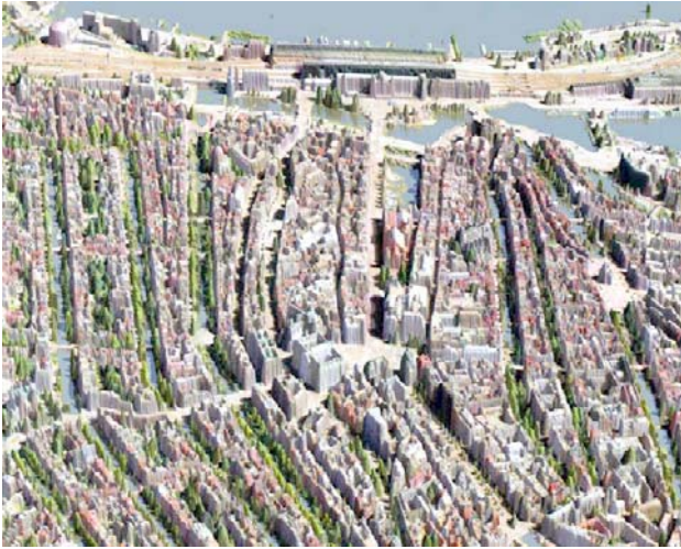
Figure 2: 'Christo Wrapping of Centre of Amsterdam