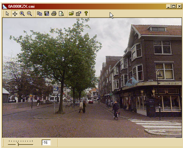
Figure 4: Cyclorama in panoramic perspective

To get a more usual representation the Cyclomedia Image Viewer has the option to show the panoramic images as if it was recorded from a central perspective (figure 4).