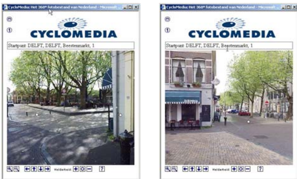
Figure 8: Interactive Navigation based on Cyclorama's

In augmenting the Cyclorama with geometric or descriptive information one issue, among a lot of others, has to be solved. Drawing features or labels at places not visible from the current point of view will result in an unrealistic and disturbed picture. This problem arises especially when augmenting the recording positions of other Cyclorama's within the one queried. This option is used in a web-based interactive navigation application, now offered for testing purposes. Figure 8 shows some screenshots.