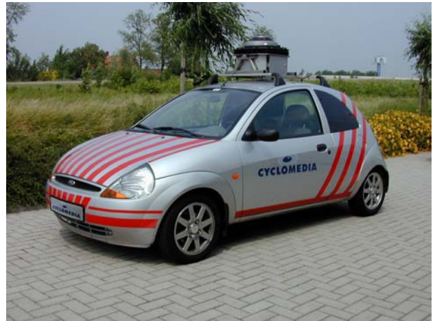
Figure 5: Cyclorama Recording Platform

The recording location of a Cyclorama is known within meter accuracy and the zero-direction of the panorama picture is chosen along the driving direction of the car, which is used as the recording platform (figure 5).