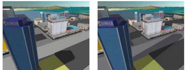
Figure 1: 3D-GIS/VR Analysis: Real time Shadow

As Kolbe addresses [Kolbe, 2004] one has to support pedestrians in the tasks of orientation and wayfinding with appropriate visualizations of their location, the surrounding, and background information. City plans and guides are intended for this purpose, but it is known that lots of people have problems to understand the scenery of a city by these abstract and descriptive, tools alone.