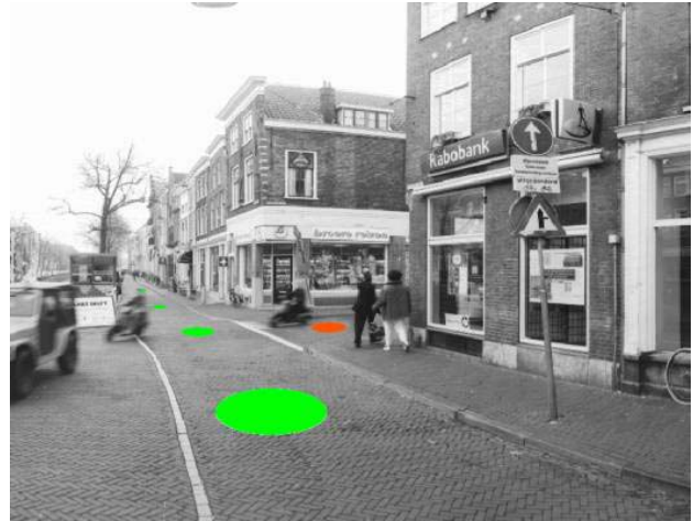
Figure 9: Perspective and distance conformed symbols