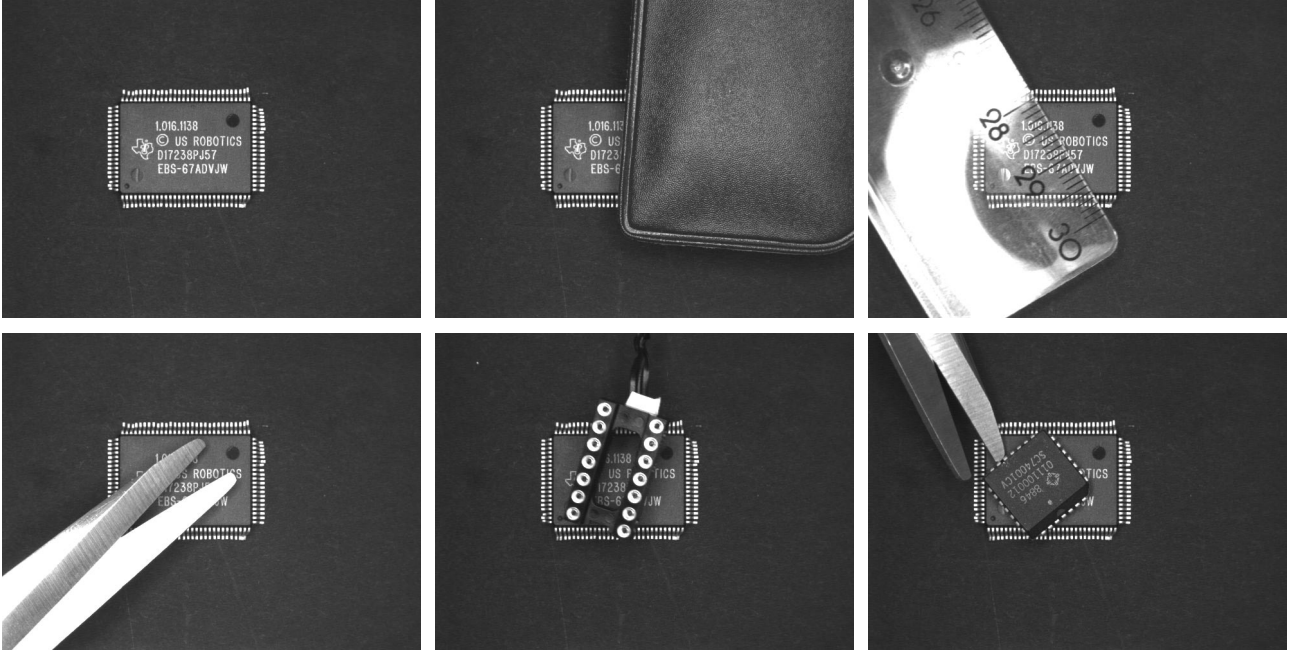
Figure 2: Six of the 500 images that were used to test the recognition rate. The model was generated from the print on the IC in the top left image. With the proposed approach, the model was found in all images except the lower right image.

after one and three iterations of the least-squares adjustment described in Section 4. Evidently, the extracted positions lie much closer to the three cluster centers. Furthermore, it can be seen that the least-squares adjustment does not introduce matching errors, i.e., outliers, and hence is very robust.