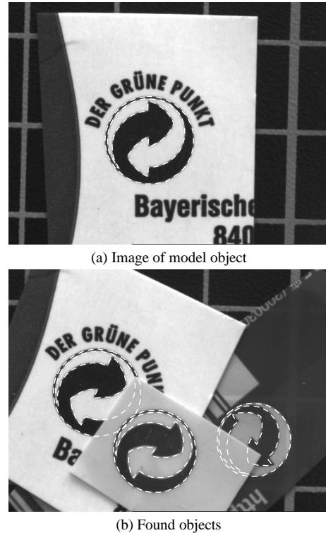
Figure 1: Example of recognizing multiple objects. Note that the model is found despite global contrast reversals and despite the fact that two of the models were printed with slightly different shapes.

To assess the performance of the proposed object recognition system, two different criteria were used: the recognition rate and the subpixel accuracy of the results.