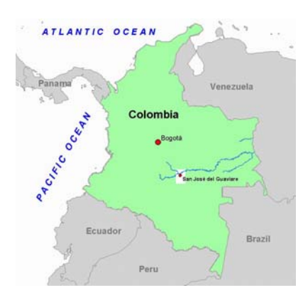
Figure 1. Location of study area

The study area is located on the northern fringe of the department of Guaviare in the Colombian Amazon. It extends from the capital of the department, San José del Guaviare, 30 km south to El Retorno from latitude 2°35' to 2°20' north and from longitude 72°47' to 72°35' west (Bijker, 1997).