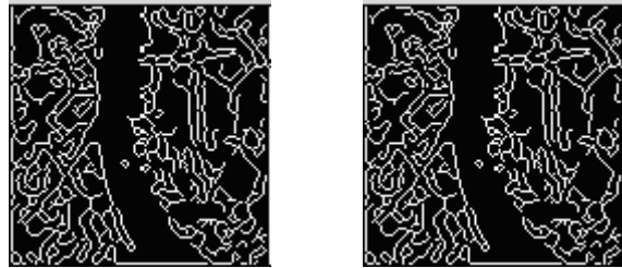
a) Original remote sensing image b) Watermarked image

We made experiments on such applications as edge detection (canny operator) and image classification to the original remote sensing image and the watermarked one respectively and the results has shown in Fig.3-4. During the course of image classification, the number of the mistakably classified pixels in the watermarked remote sensing image was 1025 and the percentage of the mistakably classified pixels of the remote sensing image was 0.3207%.