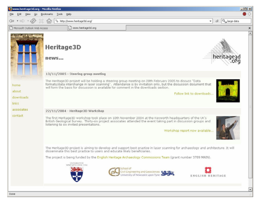
Figure 1 The Heritage3D home page

notes. It also provides links to other useful relevant websites, in addition to recognising the efforts and inputs of the project associates.