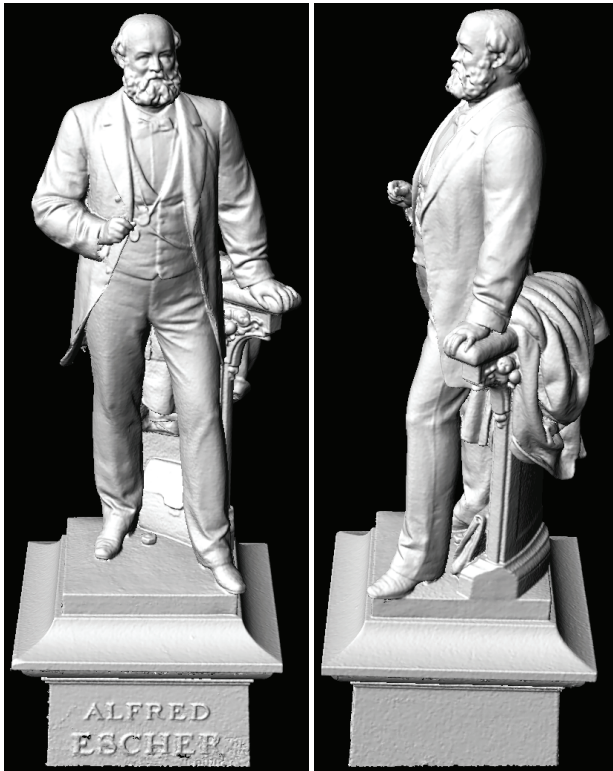
Figure 3. The final 3D model of the Alfred Escher statue.

for reading and writing is within a few milliseconds, while the memory access is within some nanoseconds. On the other hand, the memory request of the software has never exceeded 300 MB during the entire calculation.