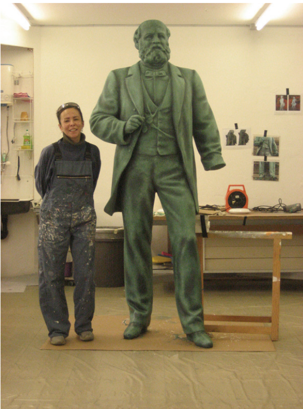
Figure 4. Still incomplete physical replica of the Alfred Escher monument (the missing parts are attached later).

After the co-registration step, all pointclouds were merged, filtered for noise reduction, sub-sampled and triangulated for surface generation. The 3D modelling operations were carried out using Geomagic Studio 9. Note that no editing has been made on the final model, except for the cropping of the area of interest (Figure 3). An edited version of the 3D model was used for the replica production. Ten replicas were produced at a scale 1:2 (Figure 4).