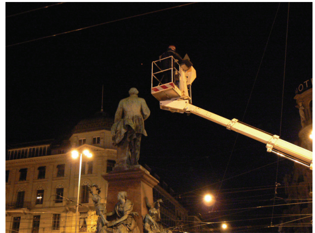
Figure 2. Pointcloud acquisition by laser scanning of the Alfred Escher statue on a cherry picker.

The digitization was done with a Faro LS880 HE80 laser scanner, placed on a cherry picker (Figure 2). Totally 36 scans were acquired during two nights of on-site work. The data set contains approximately 4.4 million points with an average point spacing of 5-10 millimetres.