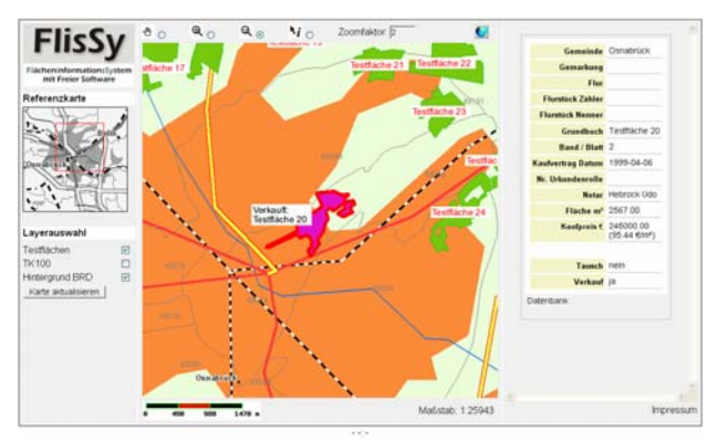
Figure 3: Original WebGIS-client in the FlIsSy-system