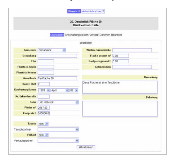
Figure 2. Screenshot of the FlIsSy-cms

To manage all these attributes a content management system (cms) was constructed (fig. 2). The cms is password secured.