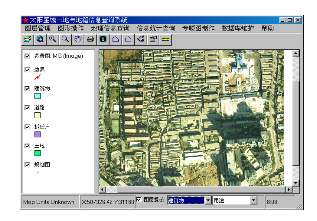
Figure 2. ESD real estate GIS

estate GIS, it can be superposed with GIS vector layer. If doing so, it deals with two technical problems. The one is how to display the raster background image and vector data at the same time in the memory? And more, is that zooming and roaming with the same scale. The other is location or matching of the raster image and the vector layer. We have a better solution for these questions, and developed the ESD real estate GIS.