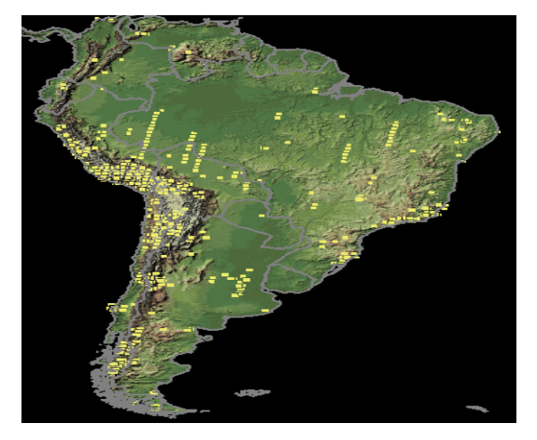
Figure 3. South American coverage for all years of ASTER DEM