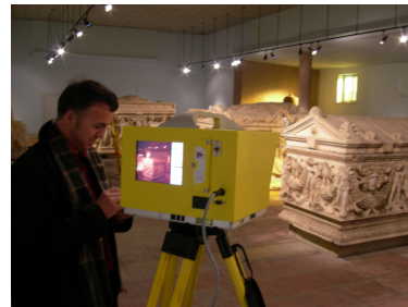
Figure 1. Laser scanning of Sidamara's grave by Optech Ilris 3D

The object dimensions are 2.5mx1.3mx1.5m (lxwxh) approximately and, it has been detailed with figure demonstrate human and animal on the object. Laser scanning was acquisitioned from four stand positions.