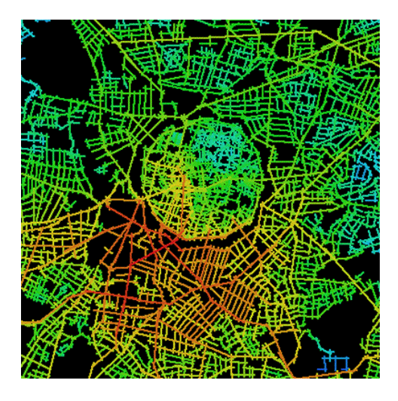
Figure 2. The City of Nicosia today - Axial Map

Administrative and government buildings also move outside the walled city and are located on strong and integrated axial lines along the same direction. The public buildings of the Greek Cypriot community are now located on integrated and easily accessible areas as opposed to the period during the Ottoman conquest. Residential areas of the Greek Cypriots move to the periphery of the new town of Nicosia and are in general segregated and not as easily accessible from the rest of the city.