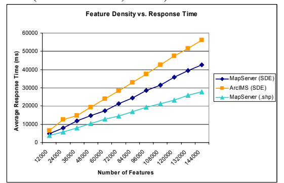
Figure 1: MapServer and ArcIMS delay times

These results have been confirmed by other tests developed by Refraction Research Inc. (PostGIS and uDig Open Source programs developer). Figure 1 shows the MapServer and ArcIMS delay times when managing different numbers of entities obtained at the Ministry of Sustainable Resource Management (British Columbia, Canada).