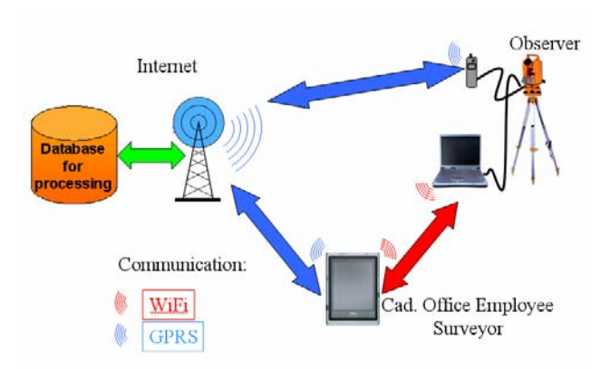
Figure 1. The schema of designed data transfer from survey device to the tablet PC

PC) that includes means for wireless communication. The communication schema is displayed in the image.