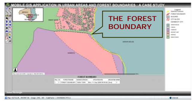
Figure 5. Presenting in web-based GIS of the determined forest boundary in the study area

Existing buildings in the system (Buildings Gokdeniz Villas of Cekmekoy) has been confirmed in the field. Additionally, nongeographical data such as site name, building name and updating date related to them has been determined by Mobile GIS device and integrated with web-based GIS. It is given in Figure 6. Due to the fact that the applications similar to this study support UIS, Mobile GIS is a significant tool for UIS.