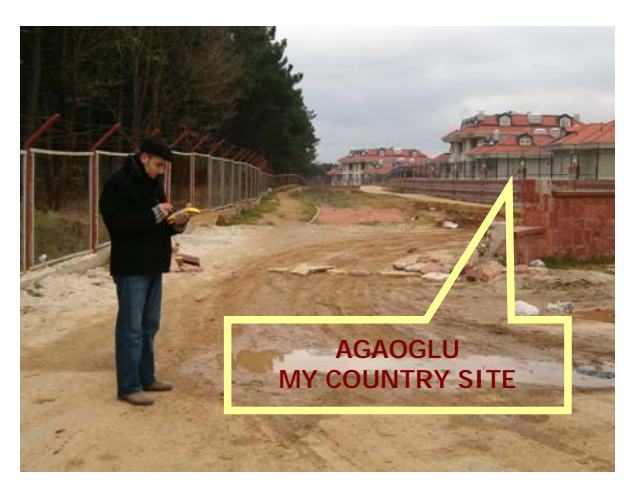
Figure 4. Up-to-date situation of the block in 2006

Forest and the built-up areas are next to each other in Cekmekoy city. The boundaries of them have constantly been determined due to change the situation of the city. In the study area, the boundary of the forest area is determined by the Mobile GIS device which is integrated with web-based GIS. Its shape length is about 1540 meters. It is given in Figure 5.