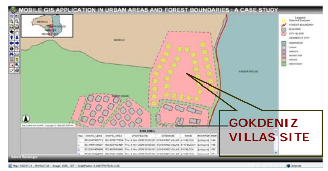
Figure 6. Query the buildings belonging to the site via webbased GIS