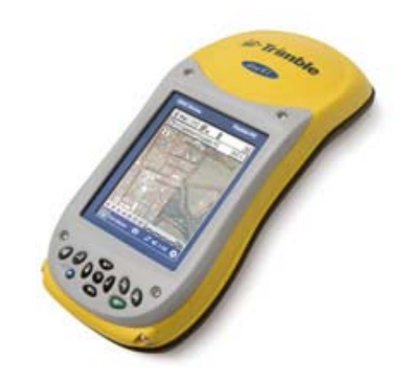
Figure 2. Mobile GIS device used for this study

Trimble GeoXT was used as mobile GIS device which consists of GPS receiver, handheld computer and installed Mobile GIS software. It is given in Figure 2.