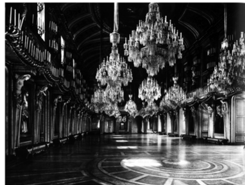
Figure 1. Milan, Palazzo Reale, the Sala delle Cariatidi at beginning of XX century

This paper analyzes such issues and describes our pipeline from data acquisition to semi-immersive visualization, applied to a specific case study: the "Sala delle Cariatidi" (Hall of the Caryatides) of Palazzo Reale a Milano. Built in 1773, it is one of most important works of the neoclassic architect Giuseppe Piermarini.