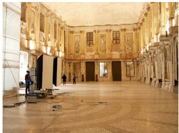
Figure 2. Milan, Palazzo Reale, the Sala delle Cariatidi today