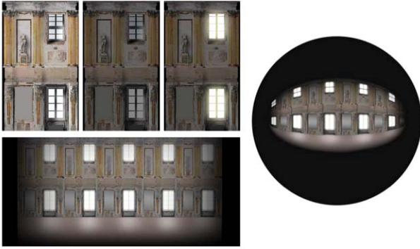
Figure 5. Phases of construction of the lighting environment map