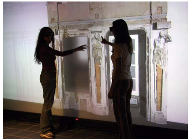
Figure 3. The simulation of the Sala delle Cariatidi restoration yard at Virtual theatre of the Dept. INDACO