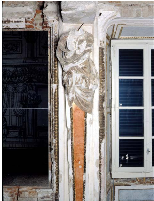
Figure 10. An original photograph used to obtain the texture map of the caryatid and the pilaster strip underneath.