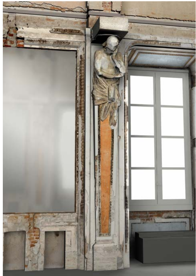
Figure 12. Rendering of the final model obtained using the texture maps of fig. 11.

In our case such problems have resulted to be marginal and therefore were not taken into consideration.