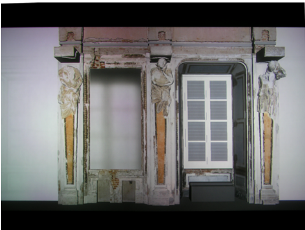
Figure 8. The videowall before and after the calibration

A typical calibration routine for two projectors is the following: