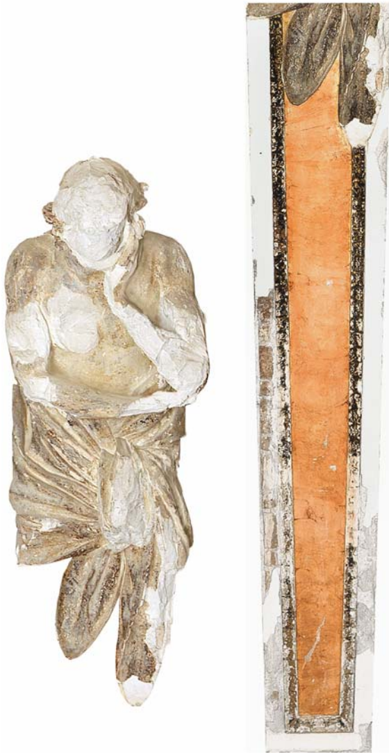
Figure 11. The texture maps obtained from the image of fig. 10

Once the image projecting planes are identified, it's necessary to correctly define the model portions onto which apply the different maps. For this operation we highlighted polygonal surfaces with different colors, according to the prevailing direction of normals: in such way it was possible to assign the most appropriate texture. Angles adopted as discriminating are 45^\circ e 135^\circ . Another possible consists of segment the object in three portions, using the intersection with two vertical planes oriented according to selected angles. Nevertheless, such method was discarded as it only performs well on regularly shaped, cylindrical objects (it is the criteria adopted for columns and capitals), but it's not as much efficient for irregularly shaped objects. For instance the head of a statue clearly requires a lateral mapping which, being in a central position, would become part of the portion to be mapped as a frontal projection. The edges between such different obtained regions have to be corrected, in order to hide the typical visible effects of: