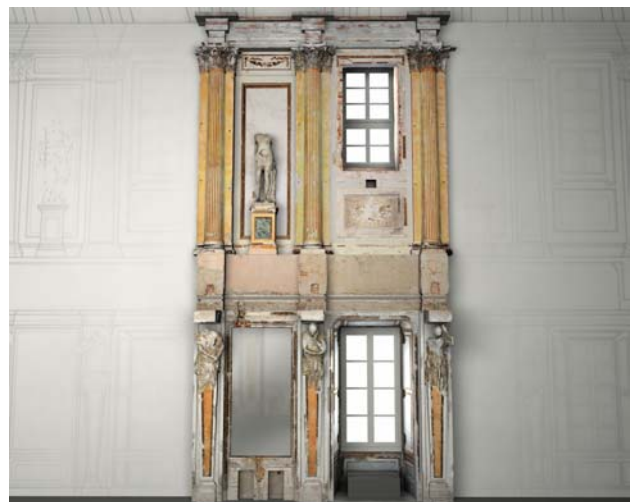
Figure 13. Real-time image of the virtual restoration yard of the Sala delle Cariatidi: current state.

Results obtained until today confirm the appealing and innovative aspects of our project. In particular, our approach offers the possibility to exploit virtual reality visualization techniques in the Heritage restoration field, with projectual goals. This method allows to evaluate a number of different hypothesis, simulating a diffuse application associated with the inclusion of virtual replicas of irretrievable lost elements.