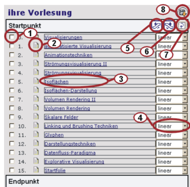
Figure 4: Creating a lecture with the LectureBuilder

The fourth part is the online documentation.