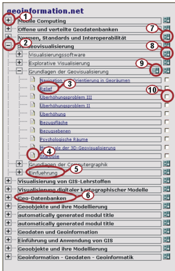
Figure 3: visualization of the accessible pool content

If slides are selected, they will be automatically added to the new lecture (Figure 4), deselected slides will automatically be removed.