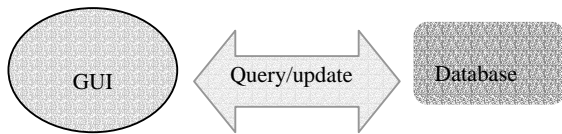
Figure 1. Application model

Database provides an interface to the software (Figure 1) where information about a geographical area (lat/longs, date of acquisition, sun zenith, sun elevation angle, gain in which it was operated and of course the histogram information in all spectral bands). Thorough analysis has been done to organize the data into tables so as to ease the query processing performance and transaction volume and satisfy the needs of the application. Object oriented database design methodology is used to design the database for this application. The data is further organized into static and dynamic tables.