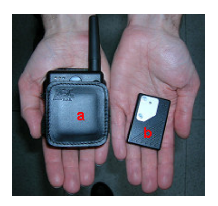
Figure 2: a: complete device KT200LinkMe ; b: a pocket radio transmitter KFT-BestIdea .

Positioning on the op-centre program screen is made drawing an icon with patient's name in correspondence of the map position of the receiver that detected the radio signal coming from the pocket transmitter. The latest receiver that grabbed the signal represents the indicative patient's position. If patient is in an intermediate position and the polling-style request made to the receivers makes the patient's position bounce from one receiver to another, a filter-like algorithm is applied: the monitored subject is positioned in an intermediate location and the data that will be stored about patient's activity will not reflect the above indicated bouncing.