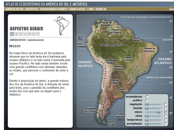
Figure 2. General Information about South America-Terrain map