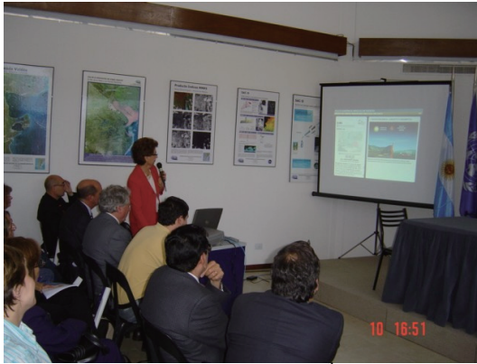
Figure 5. Atlas presentation in the 5 th Conference on Remote Sensing Education in Mercosul

during the 5 th Conference on Remote Sensing Education in Mercosul, that was held in the CONAE Space Center “Teófilo Tabanera”, in Falda del Carmen, Cordoba Province, Argentina (Figure 5).