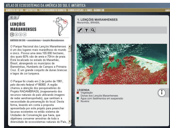
Figure 3. Lençóis Maranhenses Ecosystem