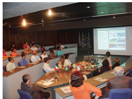
Figure 4. Atlas presentation in INPE main Auditorium in November 7 th , 2005

In November 7 th the Atlas was officially presented to the remote sensing professionals and educators in South America, during a ceremony in the National Institute for Space Research-INPE, São José dos Campos, São Paulo State, Brasil (Figure 4).