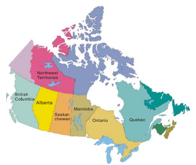
Figure 1 Spatial Distribution of Provinces in Canada

forecast the area (ha<sup>3</sup>/month/year) at Alberta (AB), the target subcomponent. The neighbouring (spatially correlated) provinces, the non-target subcomponents, are British Columbia (BC), Saskatchewan (SK), Manitoba (MB), Ontario (ON), Northwest Territories (NWT) and Quebec (QC).