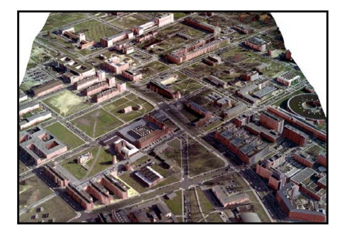
Figure 4. Textured DEM

demonstrated for the ADS40 (Reulke et al. 2006). Based on the sampling theorem, the optical system has to provide the necessary spatial frequency for Superresolution.