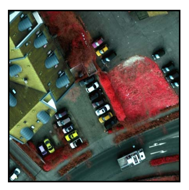
Figure 2. Panchromatic (top), RGB (middle) and CIR (bottom) images (image data by DMC/Intergraph)

complicated because of different observation conditions (e.g. SAR-systems).