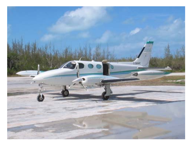
Figure 2. Cessna 335 survey aircraft

The aircraft used for the majority of the data acquisition was a Cessna 335. This is an unpressurized aircraft with twin piston engines and propeller propulsion. The was no optical window through which the LIDAR system had to fire, and thus refraction corrections for an air/glass/air interface was not needed. Other similar aircraft were also used at points in the project.