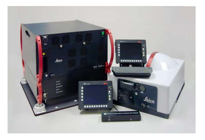
Figure 3. Leica Geosystems ALS50-II LIDAR system

The LIDAR system employed was a Leica geosystems ALS50-II, and was equipped for MPiA operation. The ALS50-II system is capable of pulse rates up to 150 kHz in both conventional and MPiA modes. In MPiA mode, the system