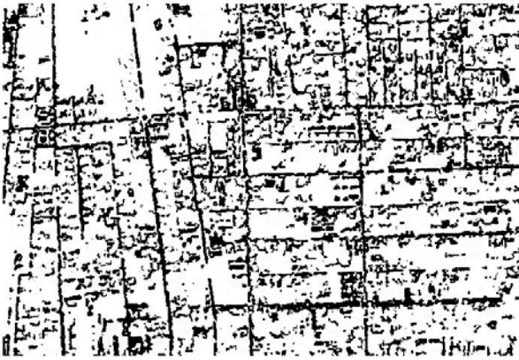
Figure 4. Classified result of road