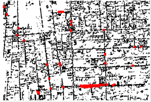
Figure 6. Extracted Road Intersections from The Classified Image