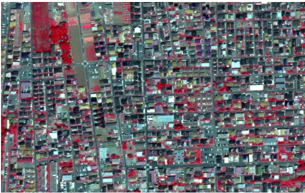
Figure 1. QuickBird image used in this experiment

This image is obtained on 7 June 2002. This area is included in Kodaira city that is located at the west of Tokyo in Japan. There are many houses, many roads, many bare grounds, many trees and many grass lands in this area. These roads have the variety of width.