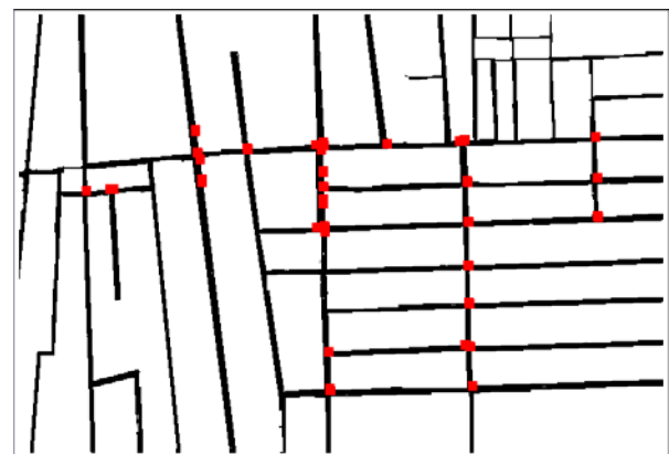
Figure 7. Extracted Road Intersections from The Visually Interpreted Image

Some extracted errors are shown in wide roads and dotted roads. Supervised classification result does not satisfy for the road intersection extraction. We cannot find out the effectiveness of the proposed double circle. We detected roads from the object image by using visual interpretation. Double circle algorithm was applied for the obtained image. As the result, extracted road intersection shown in Figure 7 was obtained. Effectiveness of proposed algorithm is shown in Figure 7.