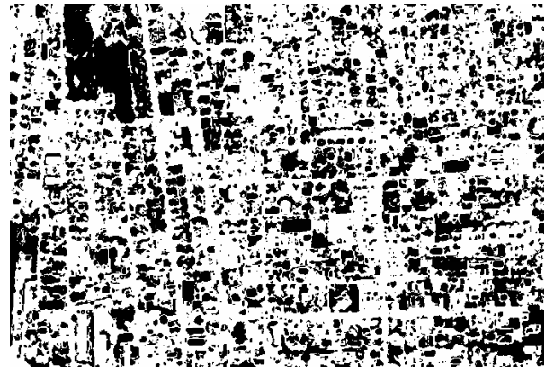
Figure 3. Mask Image

Mask image is generated from NDVI and saturation images. The image is shown in Figure 3. Black area shows removed pixels which have vegetation or high saturation. White area is candidate pixels of roads.