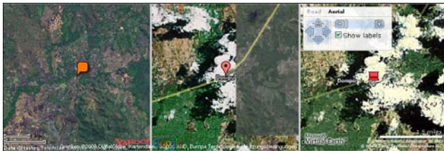
Figure 3: Result of geocoding process. Mapstraction. displays the result in Yahoo!Maps, Google Maps and Live Local.

The major result and principal benefit of this project is the design and implementation of a portal site with offers a user interface for the collection of georeferenced address information as well as for the geocoding of addresses. Additionally the geocoding operation is offered as a REST based service. The application gathers data from the users and share it freely to the community.