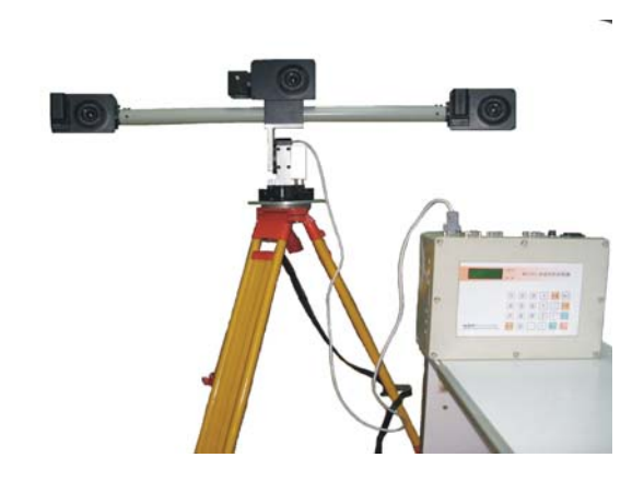
Figure 1. The stereo-camera system

In the process of digital photogrammetric measurement the direction of two conjugate rays in space can be gotten based on the same image points on stereo photopair. These two conjugate rays must have an intersection point in space which just is the spatial position of the corresponding ground point. Two stereo photopairs could be formed simultaneously on the basis of every local image set which were processed after image distortion rectification. By inputting the respective intrinsic parameters of three cameras, relatively extrinsic parameters between them and image coordinate values of homologous points on three images, the error equation and normal equation could be constructed with respect to the collinearity equation (Equation 1), so the 3D point clouds of local scene could be obtained by least-square method. But photorealistic scene surface model is not just the set of feature points in the scene, which also needs texture mapping with texture information of surfaces.