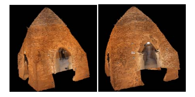
Figure 6: The entire scene model