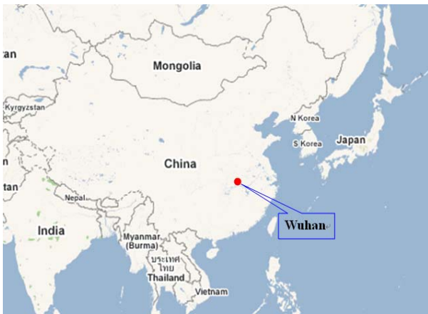
Figure 1. The geographical location of Wuhan

Wuhan(30° N, 114° E) is the largest city in central China. Wuhan occupies a land of 8494.41 km 2 , most of which is plain and decorated with hills and a great number of lakes and pools. Wuhan 's climate is a subtropical monsoon one with abundant rainfall and distinctive four seasons. The number of aerosol particles in the tropospheric atmosphere is larger than other area because of its population of 8.58 million, and the source of aerosol is complex. Aerosol affects radiation, cloud formation, and environment severely. The experimental site is on the roof of the LIESMARS building at about 39m above sea level.