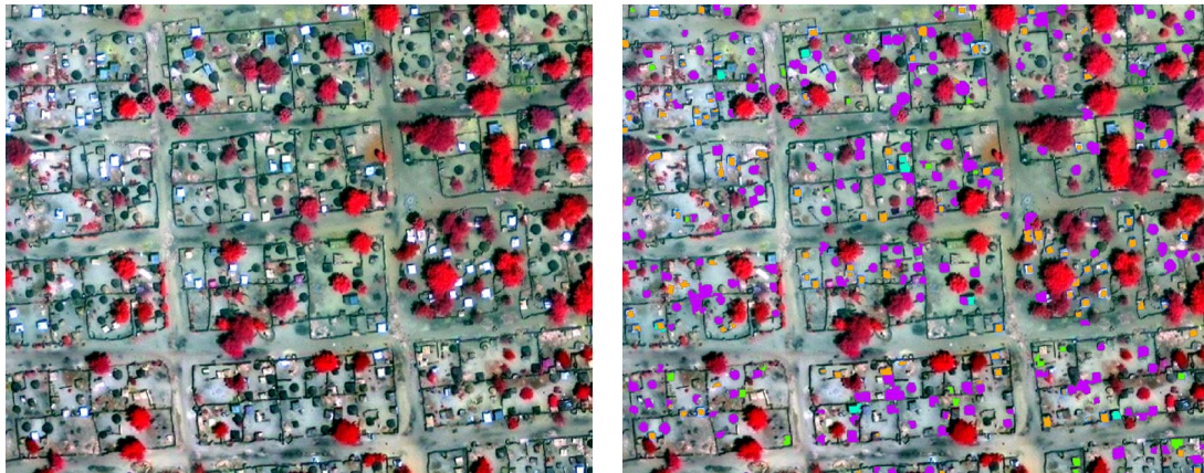
Figure 4. GeoEye-1 subset of the Um Dukhun area (300 m x 240 m, band combination 4-3-2, left) and automatically extracted dwelling structures for the same subset (right). Colour indicates different classes: purple = rondavels; orange = bright dwelling structures; turquoise = corrugated-iron huts; green = other dwelling types)