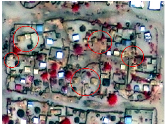
Figure 6. GeoEye-1 subset of the Dorti camp area (120 m x 90 m, band combination 4-3-2) showing dwelling types not recognized by the automated approach due to spectral similarities to the surrounding bare ground (red circles)

Using density zones instead of comparing single individual dwelling units was chosen with respect to higher readability and intuition of the extracted information. Since these products are meant to support humanitarian action including decision making processes under abnormal conditions, this aggregated way of presenting the extracted information has been chosen. Moreover it suppresses small errors at dwelling extraction and class assignment that happens likewise to manual and automated extraction. Here, the inspection of the agreement has been done by visual comparison; future research will seek to quantitatively assess the differences of the derived density zones by spatial analysis methods.