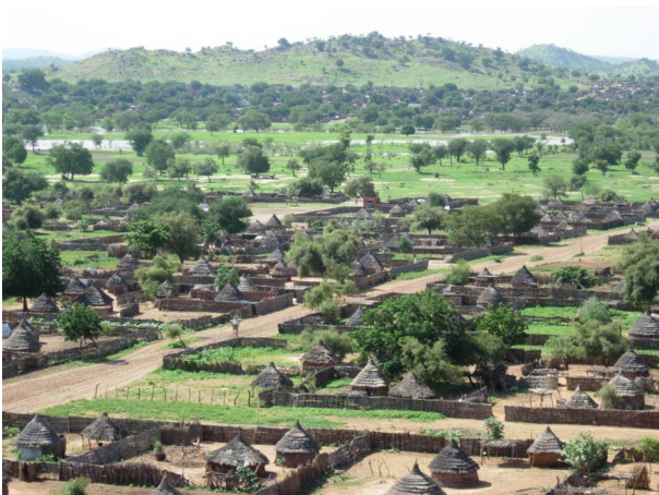
Figure 2. Traditional round huts ( rondavels ) in Um Dukhun

The camp structure is similar in all three camps. Several dwellings are bounded by fences or walls and build nearly square compounds, which are aggregated to residential blocks, separated by roads. Dwellings in the camps are either traditional round huts (known as rondavels , see Fig. 2) or tents. According to the cover and size of the dwellings several types can be distinguished: bright dwellings, corrugated-iron huts (e.g. market place in the southeast of Um Dukhun), dwellings with similar spectral reflectance as bare soil, large dwellings like schools, markets, clinics etc.