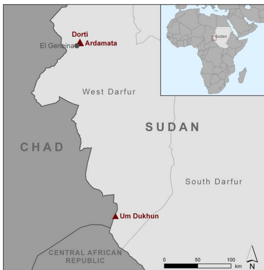
Figure 1. IDP camps Dorti, Ardamata and Um Dukhun in West Darfur, Sudan next to the Chadian border

2006; UN, 2009). Um Dukhun is located in the south of West Darfur just next to the border with Chad and less than 30 kilometres from the border to the Central African Republic (CAR). The camp is situated around a wadi and bounded by a larger wadi in the southeast and the Chadian border in the west and northwest. Developed from a former small town before the crisis in Darfur, it consists of a mixture of permanent residents, IDPs and refugees coming from Chad and the CAR (OXFAM, n.d.). Its IDP population in January 2009 was about 55,500 (56,540 total population) which is an increase of more than 47 % compared to July 2006 (UN, 2009).