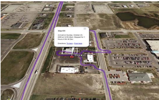
Figure 7. GPS Tracking Traps Bike Thieves

http://www.switched.com/tag/gpstracking/