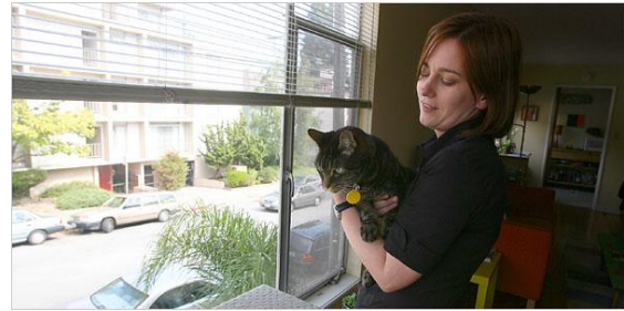
Figure 5. Google Zooms In Too Close for Some http://www.nytimes.com/2007/06/01/technology/01private.html?_r=3&oref=slogin

Maybe the most intense discussion of these issues took place with the connection of the "Google Street View". Some of the critics referred to events that can be fixed technically (change of the angle of the cameras in order to compare the result to the human view gained by passing in the street). Some events showed that the cameras overpasses fences and "caches" a glimpse of the inside of the houses trough windows. Google had encountered a lot of criticism because of reported incidents that showed people in embarrassing situations (as sunbathing on the roofs, at the doorsteps of a notorious club etc.). Although these situations were public, thus "should have" gain the protection of privacy. Other technical measures were the blurring of faces and car numbers. The real problem is that what was incidental and temporary is now public (in the internet) and " well-documented". The other thing is that an individual is lacking of both control and consent (in most of the cases he \ she is not conscious of the operating of cameras in "real time"). The existing procedure is that one should "report a problem" to Google and the decision whether to take off the picture or not, is reserved to Google.