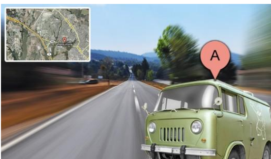
Figure 8. Joy Riding Teens Tracked and Arrested Thanks to GPS

http://rotatelog.com/gps-tracking-system-as-an-anti-theft-device.html