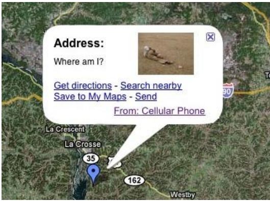
Figure 6. Police Locate Lost, Drunk Man Using GPS Chip in His Cell Phone

http://www.switched.com/tag/gpstracking/