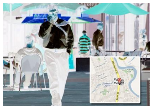
Figure 4. Australian Private Investigators Offer Illegal Spouse-Tracking Services http://www.switched.com/tag/gpstracking/