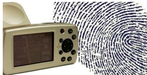
Figure 2: Texas Students Who Skip School to Be Tracked by GPS? http://www.switched.com/tag/gpstracking/