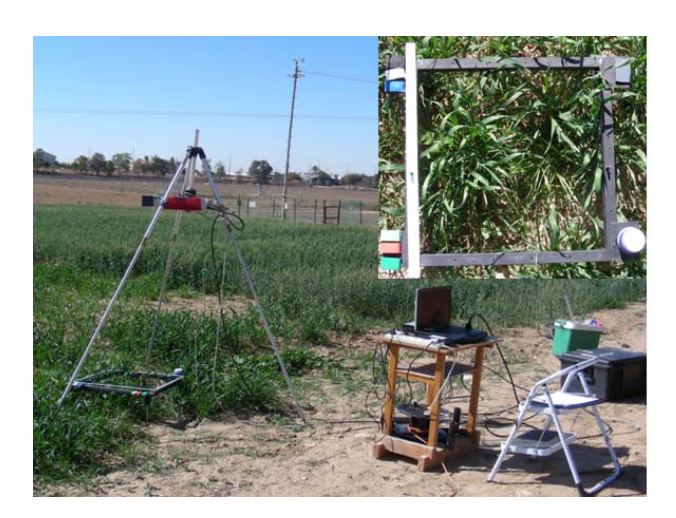
Figure 1. Spectral Camera HS in a wheat field, focusing on the sensor point of view - the frame including wheat and GW as well as BLW.

Data were also obtained in Gilat Research Center in the winters of 2008-09 and 2009-10 by the Spectral Camera HS. The camera was placed 135 cm above a frame delimiting an area of 50 by 50 cm, the frame was at the canopy level as presented in Figure 1. Relative coverage estimation of crop, BLW, GW, and soil was performed in the delimitated area located under the camera in each image. The images are in the process of transformation to reflectance values by ENVI software. The process is based on the flat field method by white referencing to pressed and smoothed powder of barium sulphate (BaSO<sub>4</sub>) positioned on the frame underneath the camera (Hatchell, 1999). By this experimental formation the images present very high spatial resolution of approximately 0.5 mm.