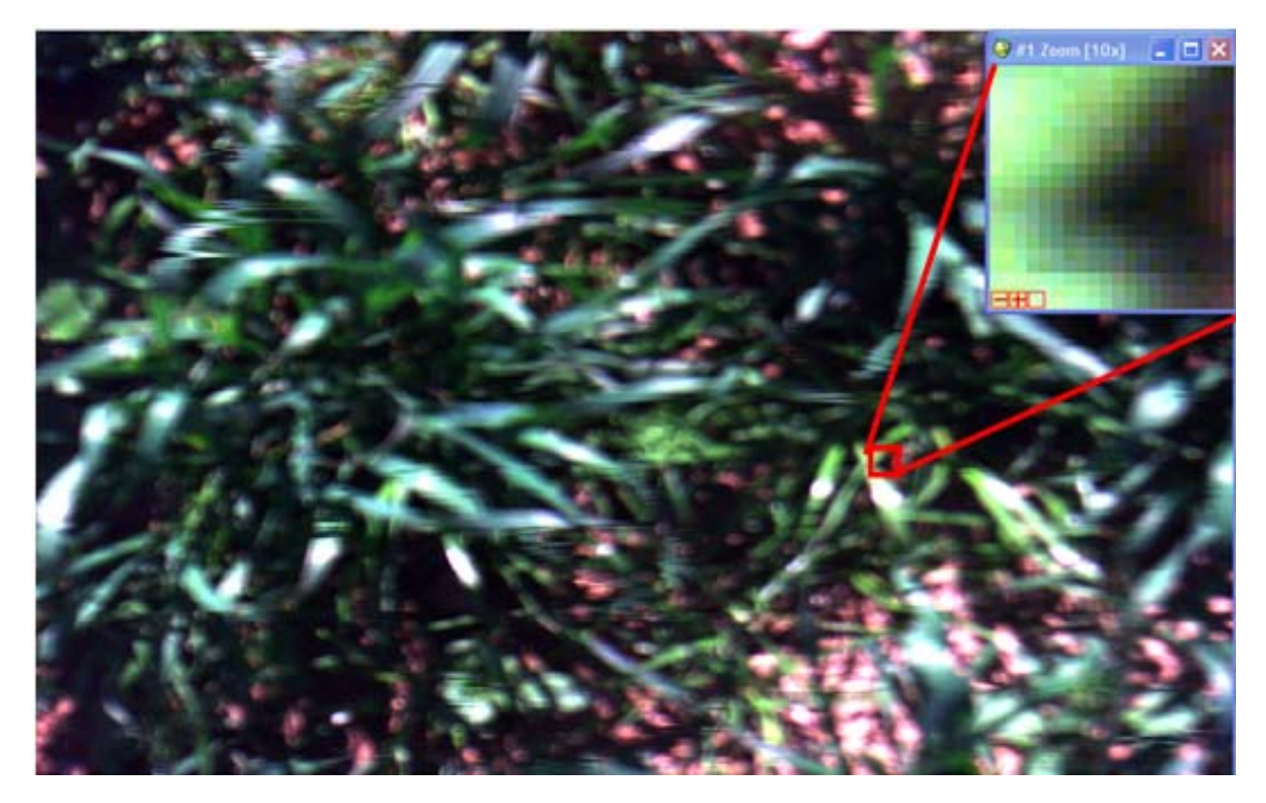
Figure 2. Spectral Camera HS image

As expected, in case of all the categories together when applying total vegetation the results are much better. This ability to predict vegetation in general better than the three categories (crop, GW, and BLW) could be due to an incorrect classification of the spectra category by the PLSR function. The results in general show that in order to develop practical application there is a need to explore the abilities farther, not only by ASD spectrometer that averages certain area to one spectrum but also by images with high spatial and spectral resolutions as can be obtained by the Spectral Camera HS.