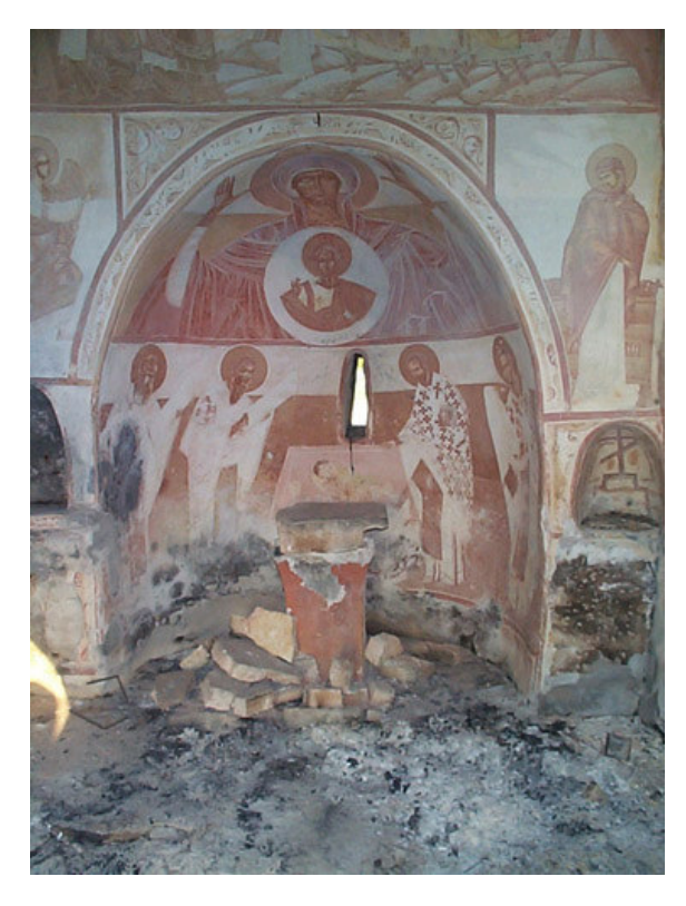
Fig. 3 Inside view of Mušutište church in 2004

Later, paintings becomes more decorative.