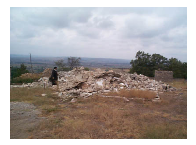
Fig. 1 Mušutište church at present

Christian-orthodox monasteries in Kosovo area, have been suffered heavy damage, even destruction, from war events and general disorders, specially in the years from 1998-2004. We deal with an important part of medieval culture, in the special area of Balkans, where Byzantine culture interferes with local interpreters of Slavonic and Greek schools, not neglecting local influence from the great western architectural and pictorial tradition, mainly trough Dalmatia.