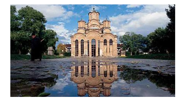
Fig. 5 Gračanica

In order to achieve a 3D GIS, we need have more pictures, photos, surveying data, etc.