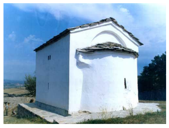
Fig. 2 Mušutište church before 2004

and national history. Undoubtedly, within the temporal boundaries of Serbian history, three caesurae were decisive