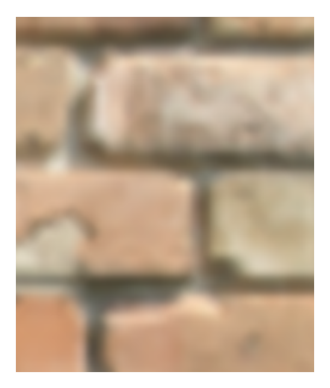
Figure 9. Filtering makes the texture look blurry and "out of focus", but is the usual method to avoid pixelization.

Finally the proposed texture synthesis approach gives a much more appealing result as shown in figure 10.