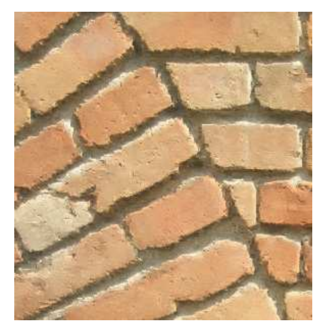
Figure 11. A part of an arch has been upscaled in two steps.

In order to test the algorithm further the same examplar was used for new photos of other walls. In figure 11 a part of an arch is shown that has been upscaled twice. One can see that the non horizontal bricks are a bit jagged and that probably depends on the fact that all bricks in the examplar are horizontal. Anyhow, the algorithm does not completely fail for these cases and it should also be noted that the bricks on the target picture was a bit larger than on the previous target picture and the algorithm still does a good job.