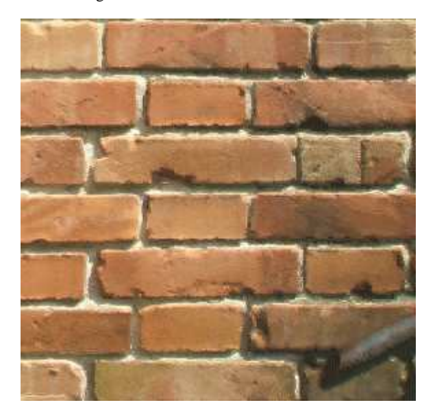
Figure 13. The artefacts disappear when a 4 times larger target image is used.

surprisingly is the rusty iron bar in the bottom-right corner quite jagged. However, worse is that the bricks have repeated patterns that do not look good. In this case the original image is taken from a greater distance than for the first target image and thus makes the bricks smaller. This might be the reason for these artefacts and this underlines the need for having the target and examplar images in approximately the same scale of details. It can also be shown that these artefacts depend on the fact that the details are too small since they will disappear almost completely if the resolution is 4 times larger for the target image as shown in figure 13.