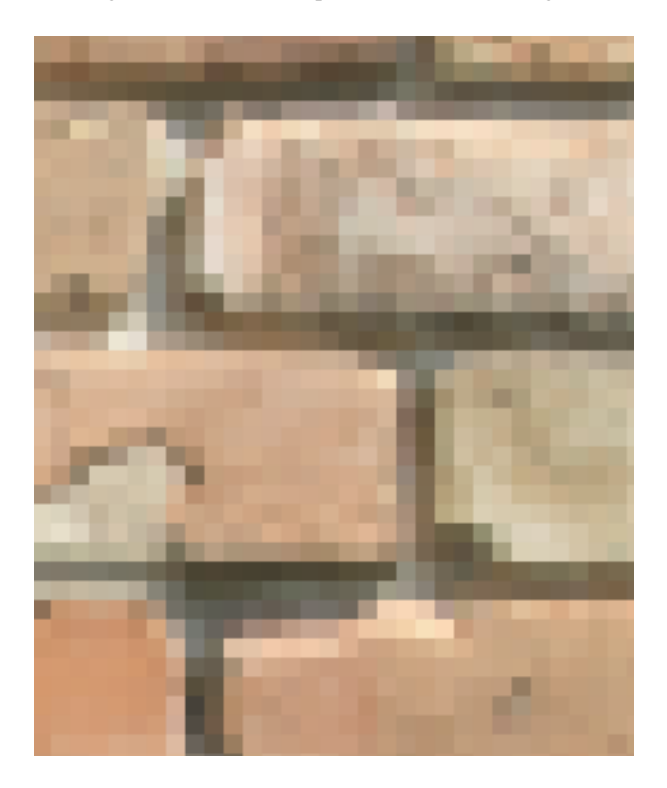
Figure 8. Zooming without filtering makes the texture look pixelized.

When the target texture is zoomed in so that each texel is 64 times larger, the texture looks pixelized as shown in figure 8.