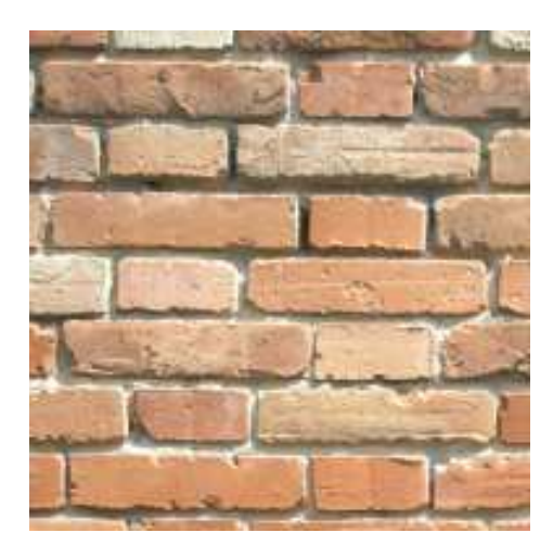
Figure 2. An examplar containing 4 times more details, 192x192 pixels

Initially the ordinary multiscale approach was examined. Since only one examplar is used it is likely that it will not contain all colours present in the target texture. It turned out that a brick in the upper right corner had a greenish tone that was not properly represented. In figure 3 the resulting texture in the right is compared to the target image on the same level of details to the left. It is obvious that the colours are not represented correctly.