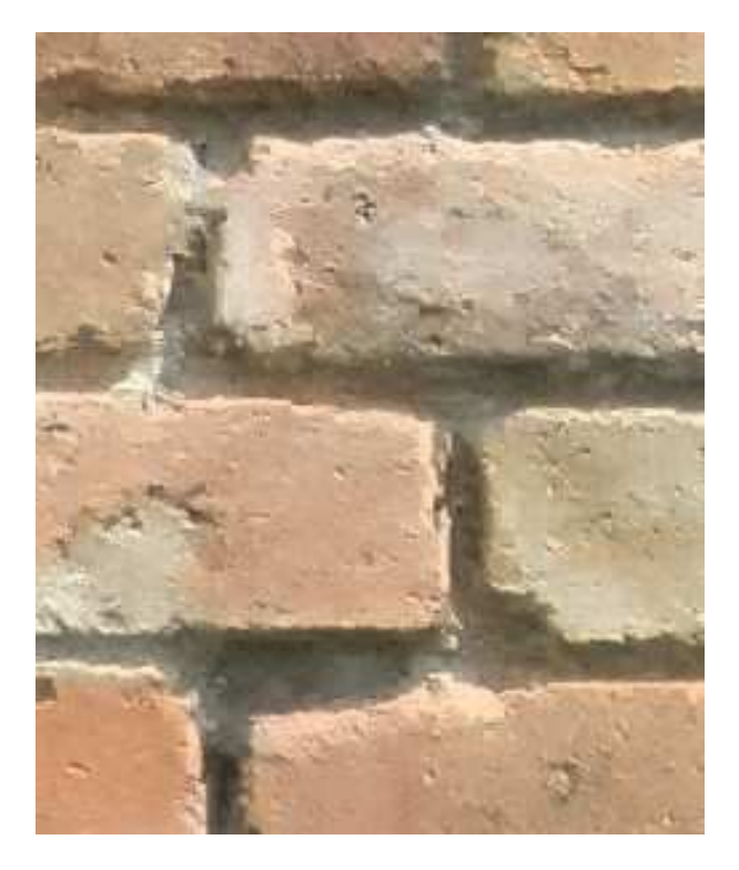
Figure 10. The proposed approach gives a much more appealing and realistic result.

Finally the proposed texture synthesis approach gives a much more appealing result as shown in figure 10.