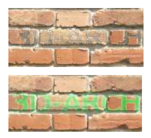
Figure 6. Ordinary texture synthesis fails in representing the colour as shown in the upper image while the proposed approach in the lower image produces colours as expected.

Then ordinary multiscale texture synthesis as well as the proposed method was used to produce the images in figure 6. It is obvious that the proposed method performs much better in reproducing the colours. Since previous methods work in RGB space, the matching will be poor as there are no green colours in the examplar image. Hence the texels will be taken from areas that are as similar as possible, i.e. giving the best match. In this case some grey colours are inserted and the text is barely visible.