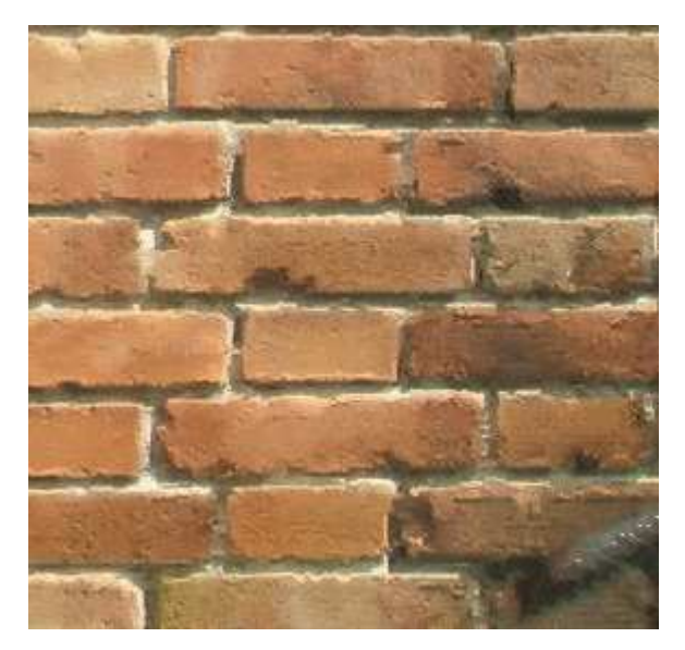
Figure 12. Artefacts are clearly visible.

In figure 12 yet another wall has been synthesized, still with the same examplars. Some artefacts are clearly visible. Not