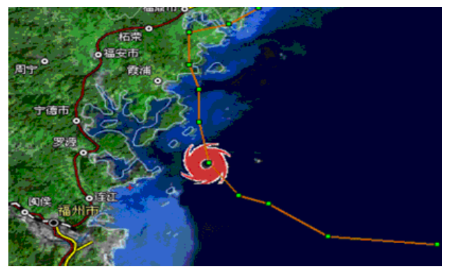
Figure 2: Electronic map with fitful symbol for publication

Those show that symbol 1 is better than symbol 2, the electronic map with symbol 1 for publish is as follows: