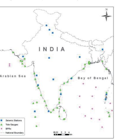
Figure 1: Real time Observational networks

In order to confirm whether an earthquake has actually triggered a tsunami, it is