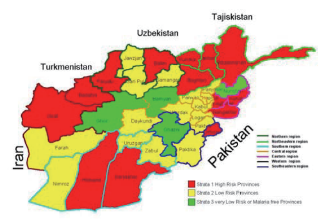
Figure 1 Provincial malaria risk strata.

Presently, around 60% of the population in Afghanistan is at risk of malaria infection (Asha, May 2003). It is estimated that the highest incidence (23%) is in the Northeast region of Takhar province, followed by Kundoz province (13%). Current malaria strata for all 31 provinces in Afghanistan are shown in Figure 1 (Safi et al., 2009).