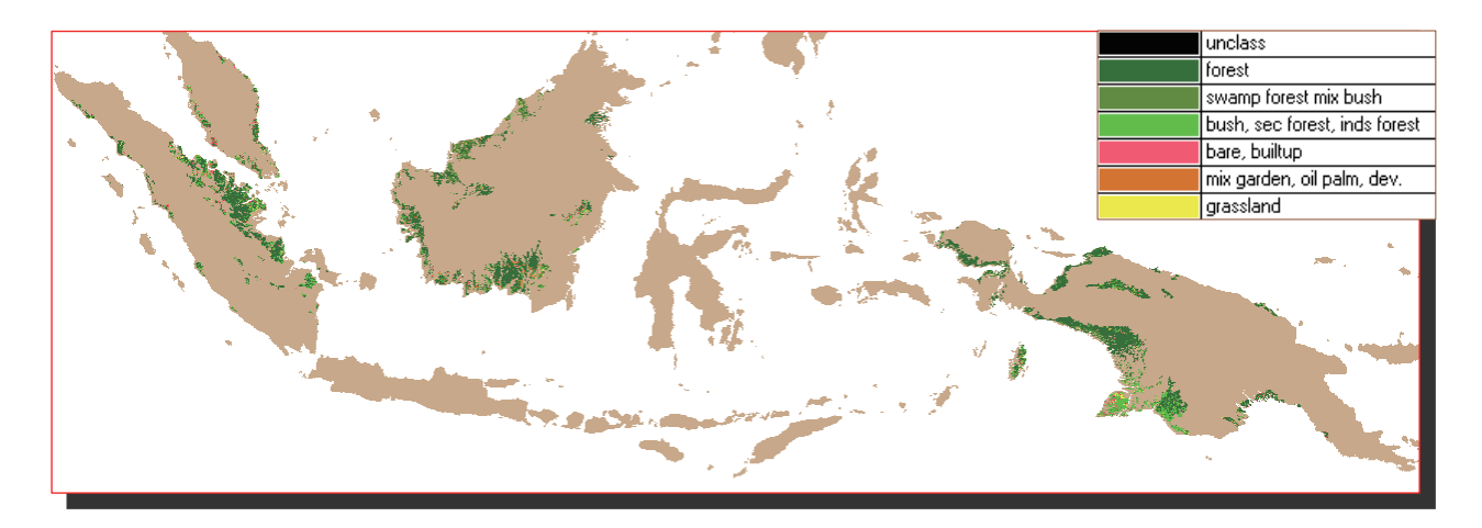
Figure 1 Land cover in the Tropical Peat Soil Area

Peat–water interrelationships in a tropical peatland ecosystem in Southeast Asia, Catena , Vol. 73, pp. 212–224