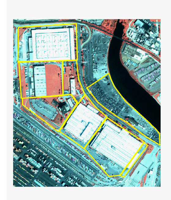
Figure 1. Brownfields sites in the southeast of Baltimore City near the Harbour. The yellow line shows the parcel boundaries.