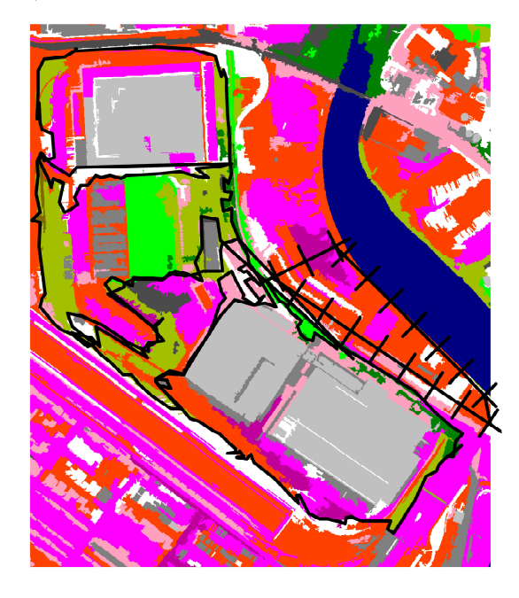
Figure 4. The black lines show correctly presented structure groups. The black outlined area including hatch marks just above the grouped brownfields marks where another brownfields site is located but cannot be detected with the presented method yet.