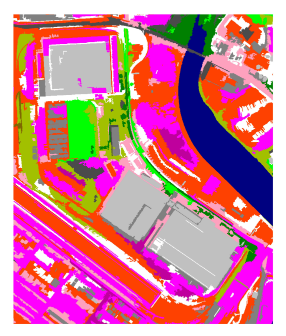
Figure 3. Classified image sample showing large industrial buildings (in light and dark grey), various numbers of cars on parking lots (in red, purple, and pink), impervious surface without distinction (in white) grass (in bright green), neglected sparce vegetation (in olive green).

The classification does not produce brownfields sites as a resulting class, but delineates the above mentioned object classes. So the classification is an intermediate step towards the targeted land use detection. In the next and final step, certain classes are put together on a knowledge based rule to define potential brownfields sites as so-called structure groups.