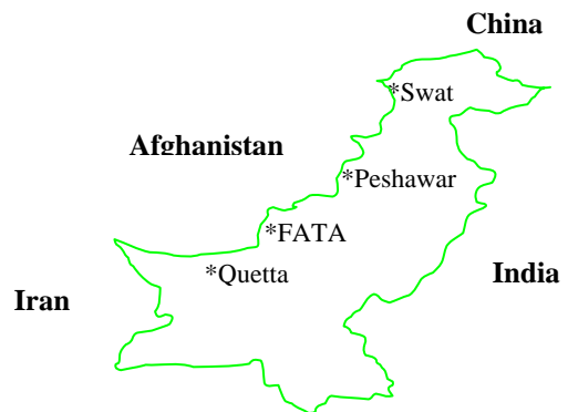
Figure 2. Areas mostly hit by terrorists in Pakistan since 2001

From Figure 2, it is evident that due to mountainous areas, the administrative bodies, security agencies and rescue teams may have faced great difficulties to access the effected area, as no updated information of the area is available since 2001. In this scenario, the use of RS to generate and extract information from satellite images is the only viable solution. Moreover, trenches and under ground bunkers are also reported in media ( http://pakobserver.net/detailnews.asp?id=21126 ) that were and are still being used by terrorists as hideouts. To identify such underground locations is only possible with the help of RS technologies as described in Table 1. Therefore, the arguments and real life example presented so far, proves and underscores the supportive role of RS for antiterrorism and rescue efforts. Brief summary of importance of RS for antiterrorism and rescue efforts is tabulated as Table 2.