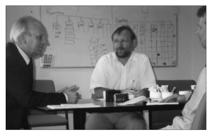
Somebody who is busy developing techniques and tools without understanding the real world problems for which they could be used to find solution will ultimately lose his role in society.

subjects became a substantial part of any surveying curriculum and, in addition, one had to learn much about the gravitational field because of the role of the geoid in mapping. To understand all these subjects to the level at which they might be properly applied in professional life took a substantial part of the time available in university curricula. However, carrying out heavy computations is no longer the daily work of the surveyor. Many complex data transformations are now embedded in software easily run on a PC. The change from penand-paper computations to software tools over the last