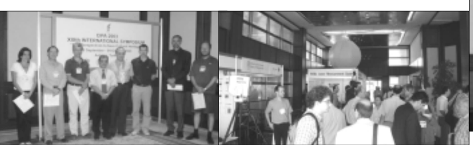
Best Poster Awards Winners.

Information can be received from sergio.dequal@polito.it