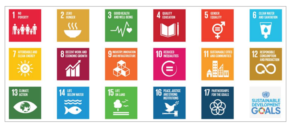
Figure 1: The 17 Sustainable Development Goals of the United Nations [2]

implement many of the 2030 UN Sustainable Development Goals (SDGs) [2] shown in Figure 1. Indeed, it has been estimated that approximately 20 % of the UN SDG Indicators (SDGIs) can be interpreted and measured either through direct use of geospatial data itself or through its integration with other statistical data [3]. Thus, obtaining reliable geospatial data has become a crucial task for member nations to prepare their national reports or for the UN to undertake global reporting. One of the most powerful geospatially-derived products from which SDGIs can be generated is provided through global land cover (GLC) information.