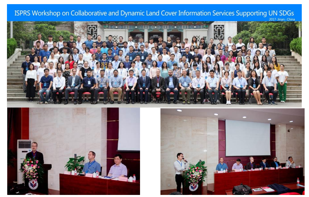
Figure 2: Images of the Jinan workshop.

Some of the particular topics and issues identified and addressed in the workshop included: