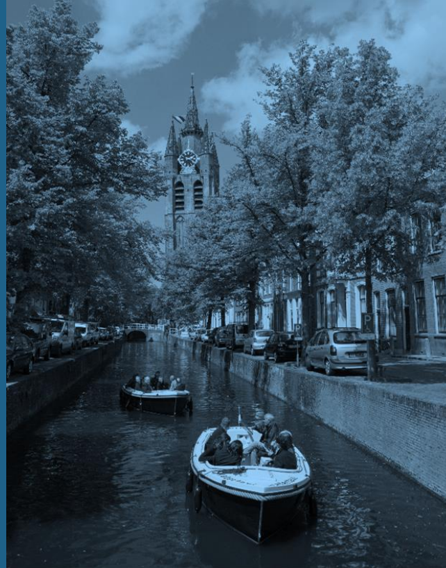
City of Delft. The Netherlands