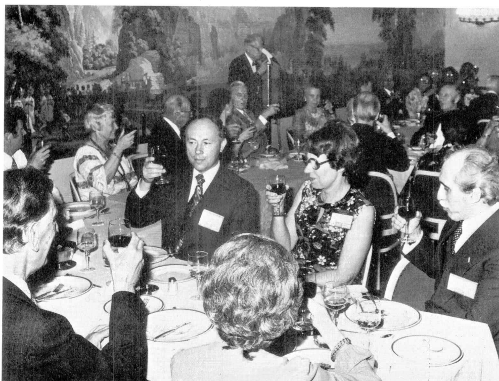
Guests at the Banquet in the garden of Hotel Kalastajatorppa on the shore of the Gulf of Finland.