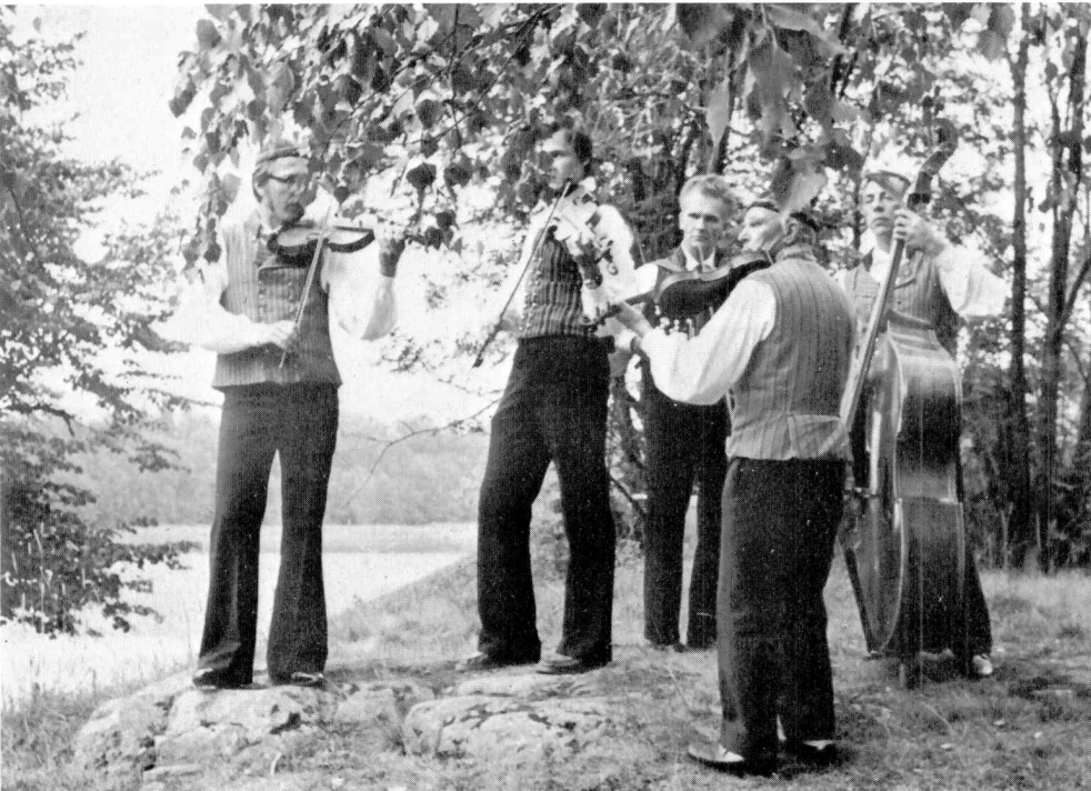
The first week closed with a folk festival on the island of Seurasaari. Merry musicians in national costumes met the guests.