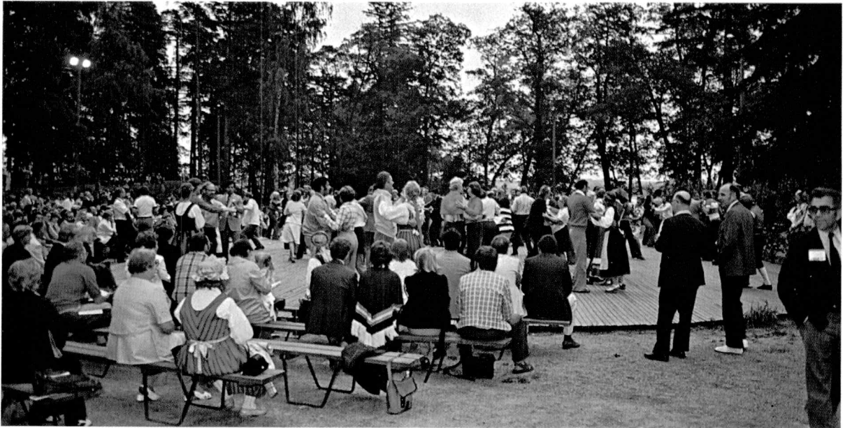
At the open air folk festival, picnicking in front of an old stable and dancing out in the open.