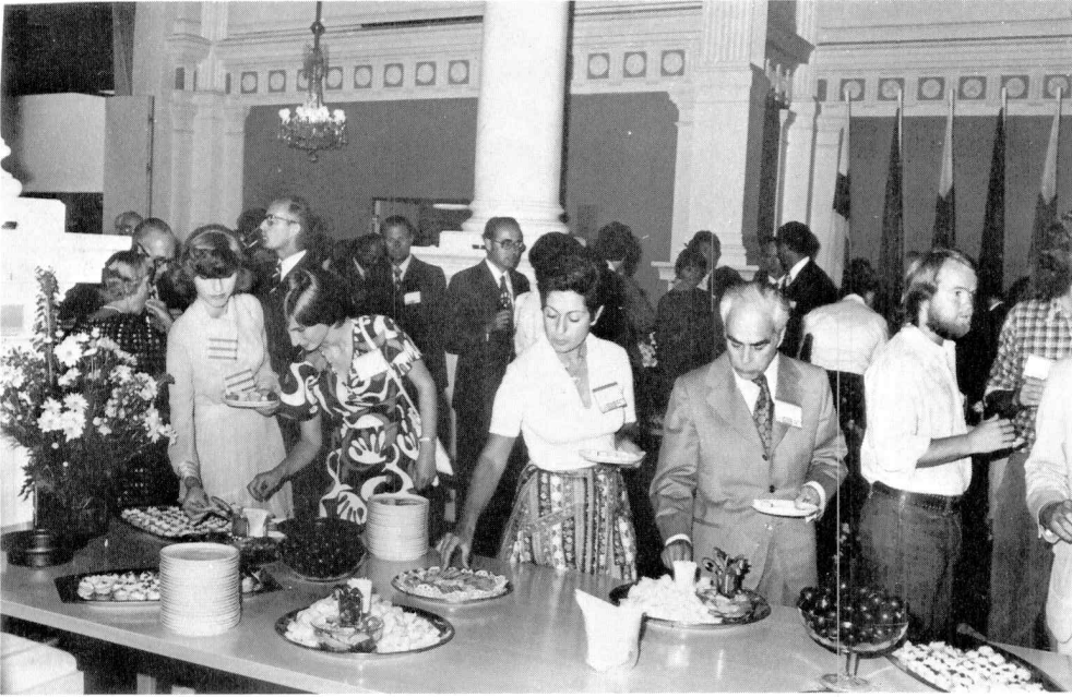
The first day of the Congress closed pleasantly with a reception arranged by the City of Helsinki in the neoclassical Town Hall. Some 1200 guests attended.