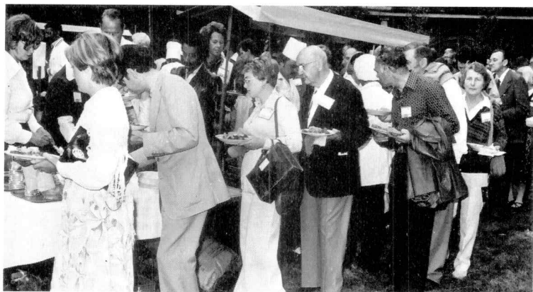
After the program including a visit to the open air museum, social games and contests, the quests were served traditional Finnish foods and beverages.