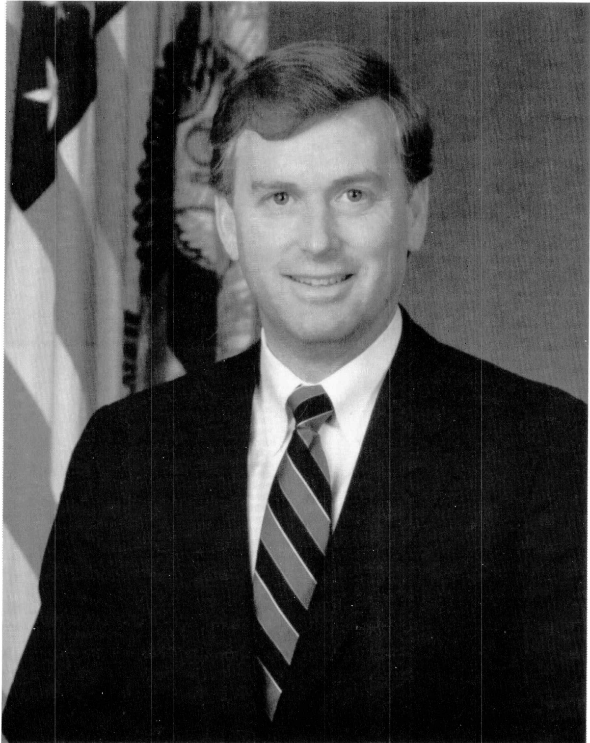
The Honorable Dan Quayle Vice President of the United States of America Patron of the Congress