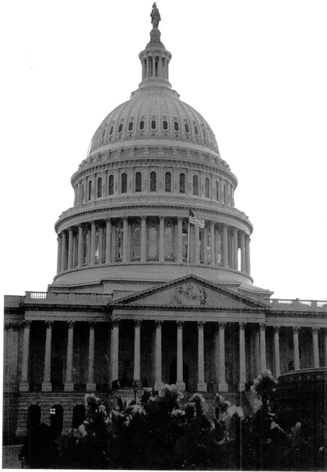
United States Capitol Building