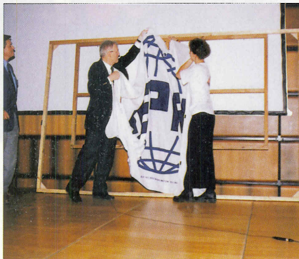
During the Closing Session small gifts were presented to the friends