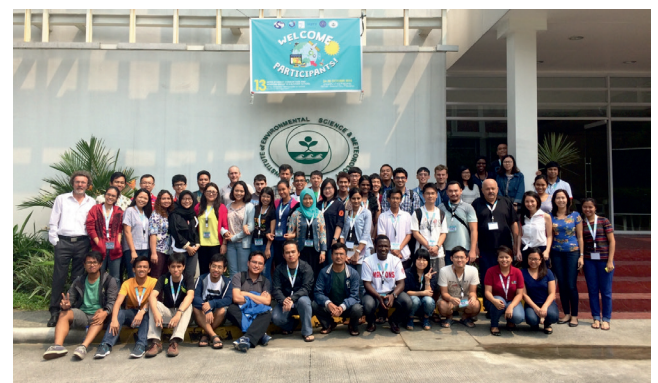
Figure 4. Group photo at the 2015 summer school in the Philippines.

Apart from the ACRS, two additional SS were organised. The first one occurred in Addis Ababa, Ethiopia in 2013 as a response of the SC to the growing need for further knowledge and education in remote sensing and other geospatial sciences in this country. This was an important SS for the SC since it signified the expanding reach of the organization. Through the assistance of local authorities in 2013 at the UN Economic Commission for Africa (UNECA) Headquarters in Addis Ababa, this SS was able to accommodate participants from six African countries (Rwanda, Uganda, Tanzania, Ethiopia, Nigeria, and Kenya).