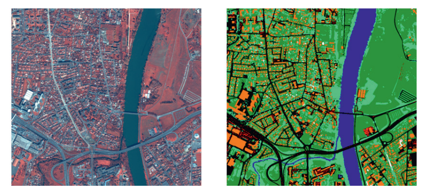
Figure 1: Left: NIR-R-G image, right: annotation with 'impervious surface' (dark gray), 'building' (brown), 'pervious surface' (dark green), 'high vegetation' (light green), 'cars' (red), and 'water' (blue).

We chose two Worldview II satellite images from April 2011 and February 2016 covering an area of 25km<sup>2</sup> of the greater city center of Toulouse. The images were annotated into 6 land cover classes and splitted into smaller tiles, which are divided into training and test data (see Fig. 1).